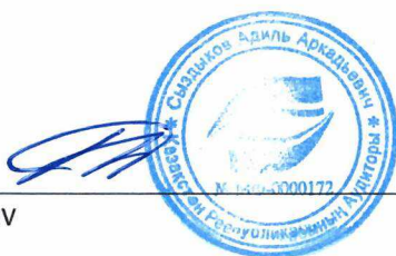
Adil Syzdykov Auditor

Auditor Qualification Certificate No. МФ - 0000172 dated 23 December 2013